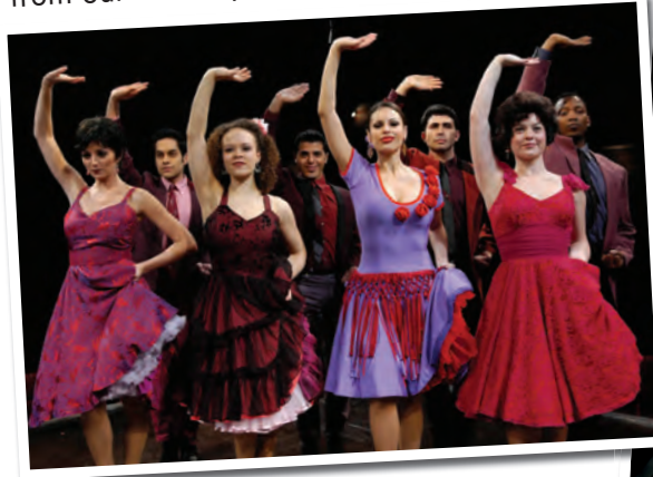
WEST SIDE STORY Photos from our earlier productions.